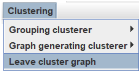
Figure 37. The menu system after changing to cluster graph

All the now mentioned constraints will be changed back, and the original module graph will be seen in case you choose the Leave cluster graph entry (see Figure 37).