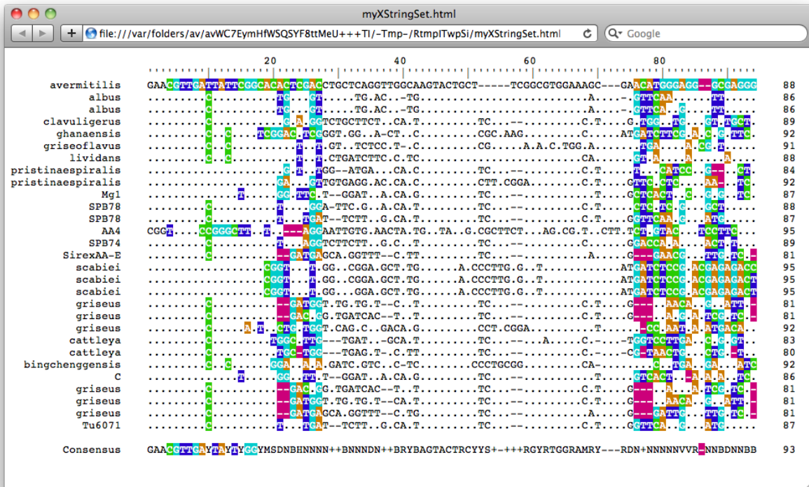
Figure 2: Amplicon with the target site for each primer colored

> amplicon <- subseq(dna, 247, 348) > names(amplicon) <- desc > # only show unique sequences > u_amplicon <- unique(amplicon) > names(u_amplicon) <- names(amplicon)[match(u_amplicon, amplicon)] > amplicon <- u_amplicon > # move the target group to the top > w <- which(names(amplicon)=="avermitilis") > amplicon <- c(amplicon[w], amplicon[-w])