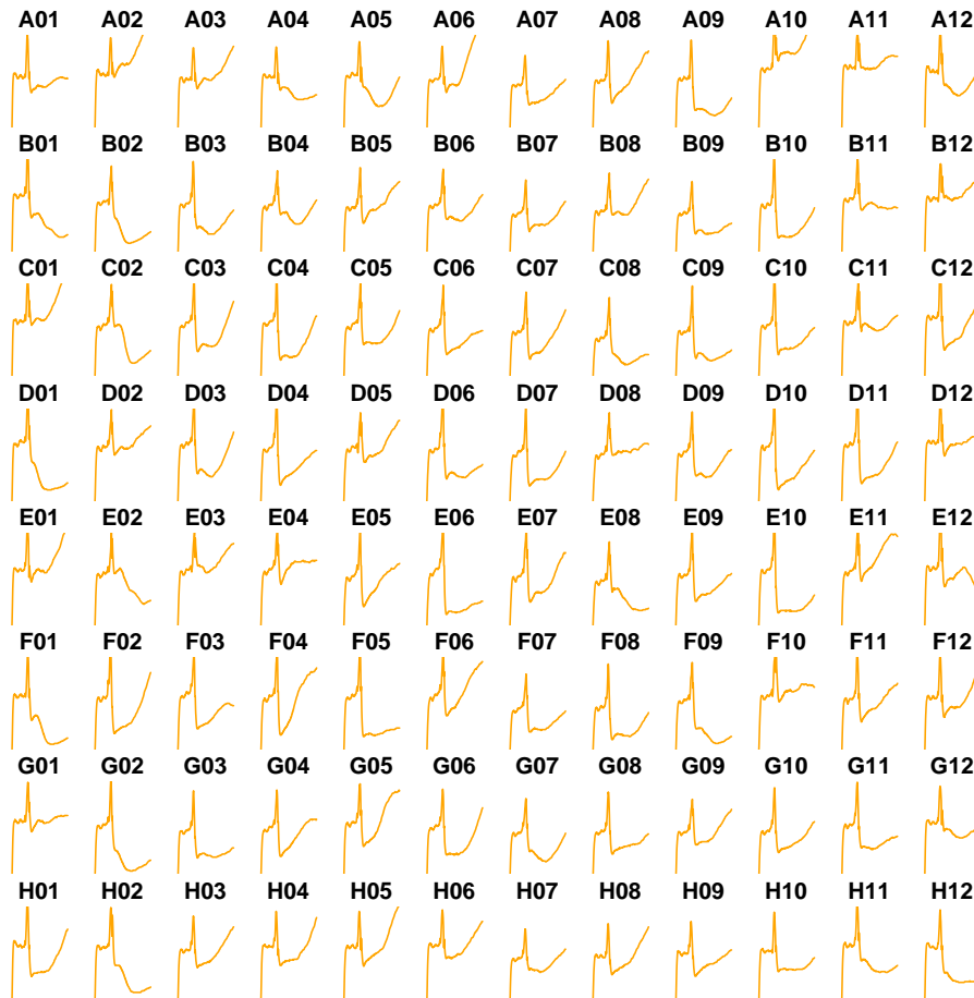
Figure 3: Plate view of a 96-well E-plate from a RTCA assay run.