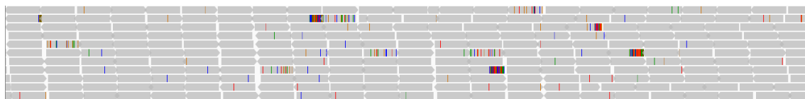
Figure 3: Simulated reads mapped in proper pair Mismatches and soft-clips are shown as colored vertical lines in reads.