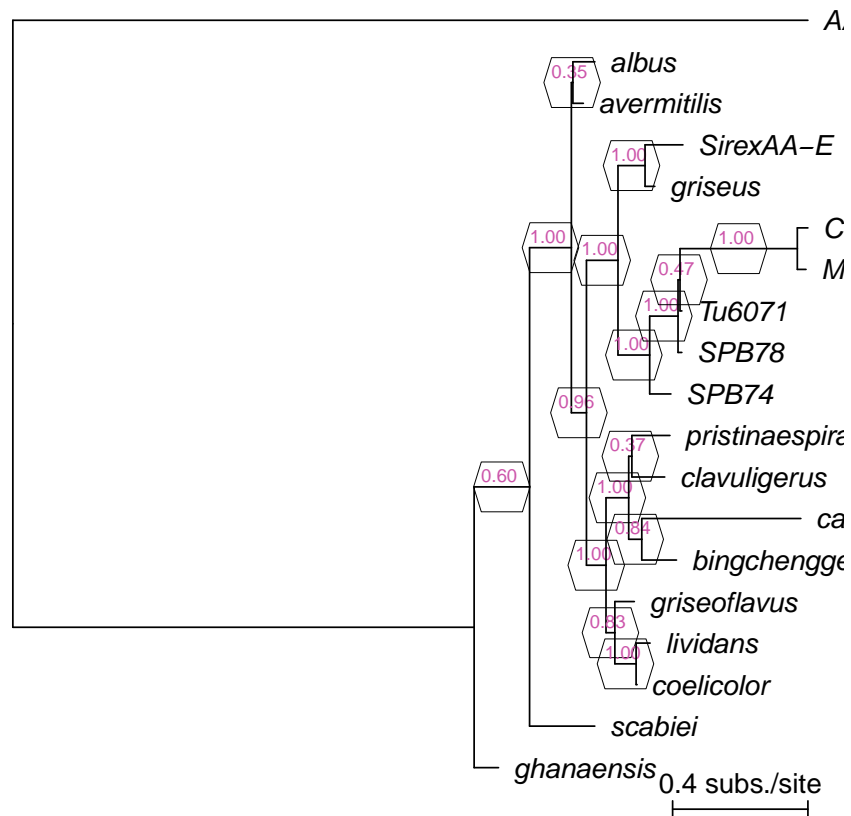
Figure 2: Tree with (aBayes) support probabilities at each internal node.

> plot(dendrapply(tree, function(x) { s <- attr(x, "probability") # choose "probability" (aBayes) or "support" if (!is.null(s) && !is.na(s)) { s <- formatC(as.numeric(s), digits=2, format="f") attr(x, "edgetext") <- paste(s, "\n") } attr(x, "edgePar") <- list(p.col=NA, p.lwd=1e-5, t.col="#CC55AA", t.cex= if (is.leaf(x)) attr(x, "nodePar") <- list(lab.font=3, pch=NA) x })), horiz=TRUE, yaxt='n') > # add a scale bar > arrows(0, 0, 0.4, 0, code=3, angle=90, len=0.05, xpd=TRUE) > text(0.2, 0, "0.4 subs./site", pos=3, xpd=TRUE)